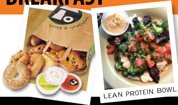
LEAN PROTEIN BOWL