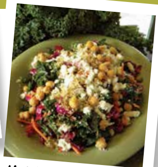
HAIL TO THE KALE

ADD JUST-GRILLED STEAK, SALMON, CHICKEN, SHRIMP, TOFU or QUINOA for an additional charge served with a fresh-baked breadstick HALF or REGULAR