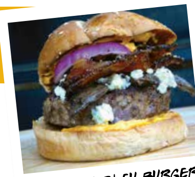
BLACK & BLEU BURGER