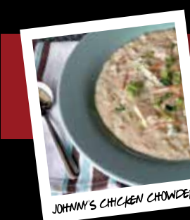
JOHNNY'S CHICKEN CHOWDER