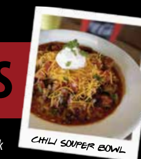
CHILI SOUPER BOWL