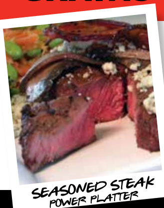
SEASONED STEAK POWER PLATTER

SUBSTITUTE JUST-GRILLED STEAK, CHICKEN, SALMON, SHRIMP, TOFU or QUINOA for an additional charge served with a fresh-baked breadstick REGULAR or LARGE