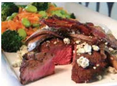
Seasoned Steak with portabella mushroom, bleu cheese & peppered maple bacon