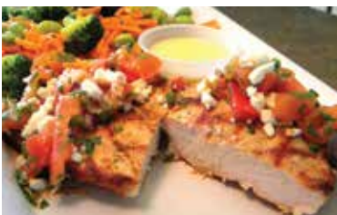
Marinated Chicken Breast with pico de gallo & feta cheese