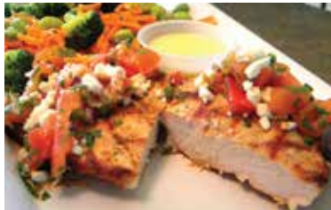
Marinated Chicken Breast with pico de gallo & feta cheese