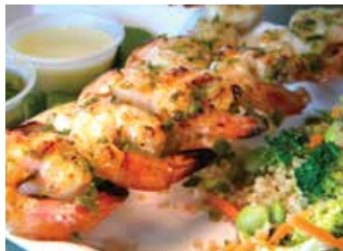
Lemon Shrimp Skewers with fresh herbs & tangy lemon