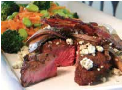
Seasoned Steak with portabella mushroom, bleu cheese & peppered maple bacon