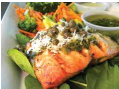
Herbed Salmon with fresh herbs, capers, peppered maple bacon & parmesan cheese